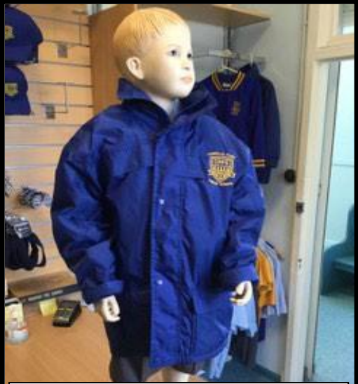
“Dry and Cosy” Jacket